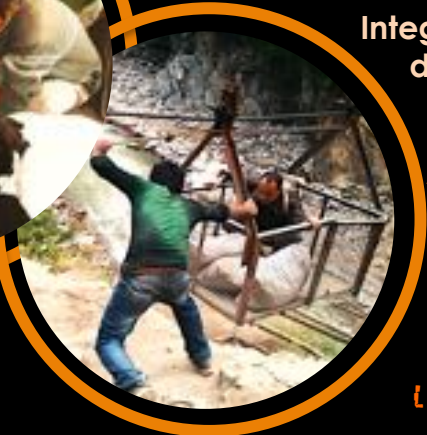
Integrating lessons from disaster response