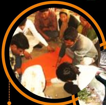
Consultations on stakeholder needs and roles